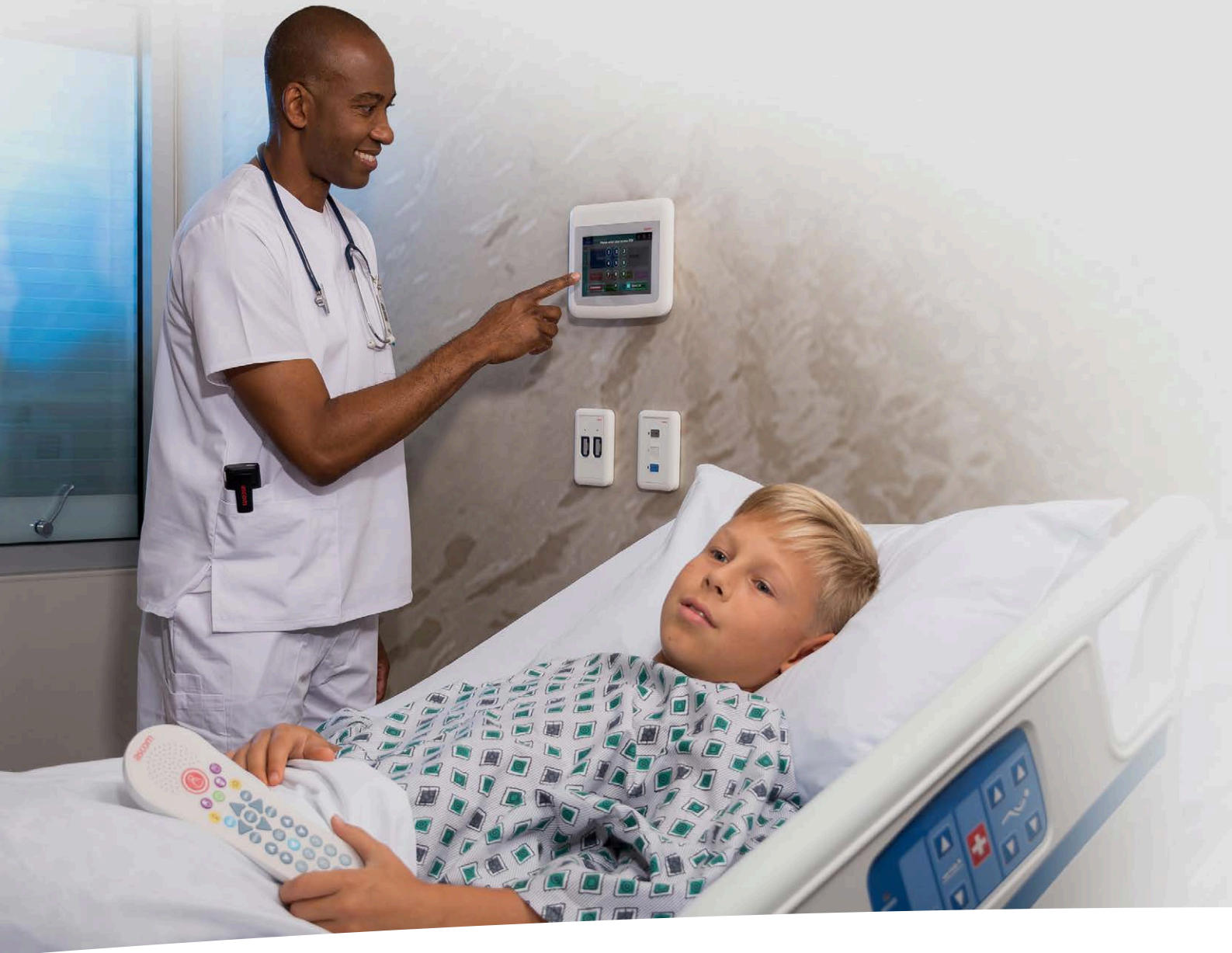
Quick Charting via Ascom TelliConnect Station

Telligence from Ascom is the world's first Patient Response System. With Intelligence, caregivers now have relevant information at the point of care and throughout the care process. Built on the Ascom Healthcare Platform that collects information from multiple sources (the patient, medical devices, healthcare applications and other systems), Intelligence gives clinicians a more comprehensive view of the patient's status that goes well beyond traditional nurse call. As a result, caregivers are better informed when responding to patient requests.