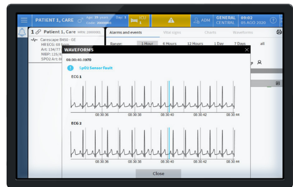
Smart central live waveforms view

The capability to view waveforms when away from the unit in near real time helps to streamline patient care whenever coordination with colleagues is required, to evaluate a patient's condition and decide on the best course of action. The automatic capture and syncing of waveforms snapshots with events helps to provide valuable context to alerts, which supports alarm management workflow.